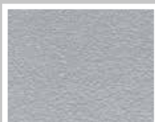
F90 Aston Silver