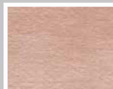
F93 Cosmo Rose Gold